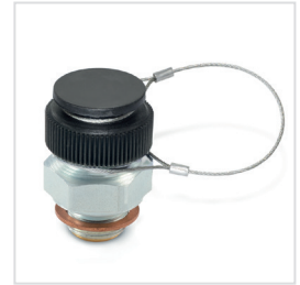
3 Type K with plastic protective cap and retaining cable